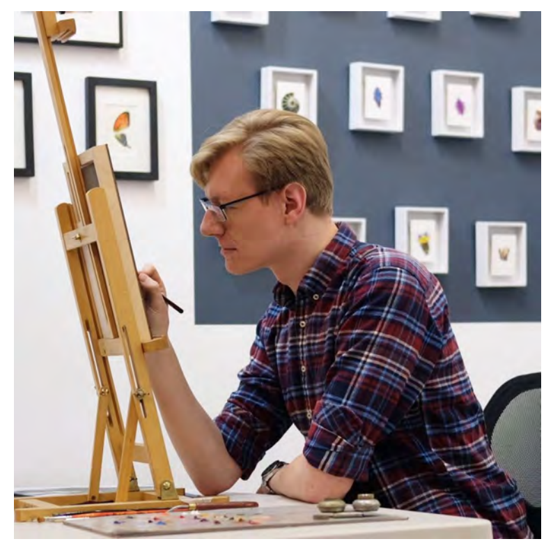
As you explained in your statement you use an analytical approach when you create your artworks. What are exactly the elements that you try to investigate in your subjects?

I think it all boils down to trying to obtain the highest amount of information about the subject by mere observation of its surface. At the end of the day, I think that is all we have as realist artists-surfaces and their interaction with light. I believe most of us try to permeate that surface in one way or another to possibly transcend a technical, photographic reproduction. I especially enjoy paintings that are able to speak to more than just our vision. I am always obsessed with an object's surface textures, trying to interpret these textures and induce a tactile sensation is very important to me. Just to be clear I am not referring to the texture of the paint itself, I am referring to the synesthetic sensation, the illusion, that a painted fur feels soft and fluffy because the artist's arrangement of pigment is convincing to us as such. A viewer of my work had once told me she could hear the dried leaves rustle under her feet and smell the earth and moss when looking at my painting, those kind of reactions are the greatest compliments to me.